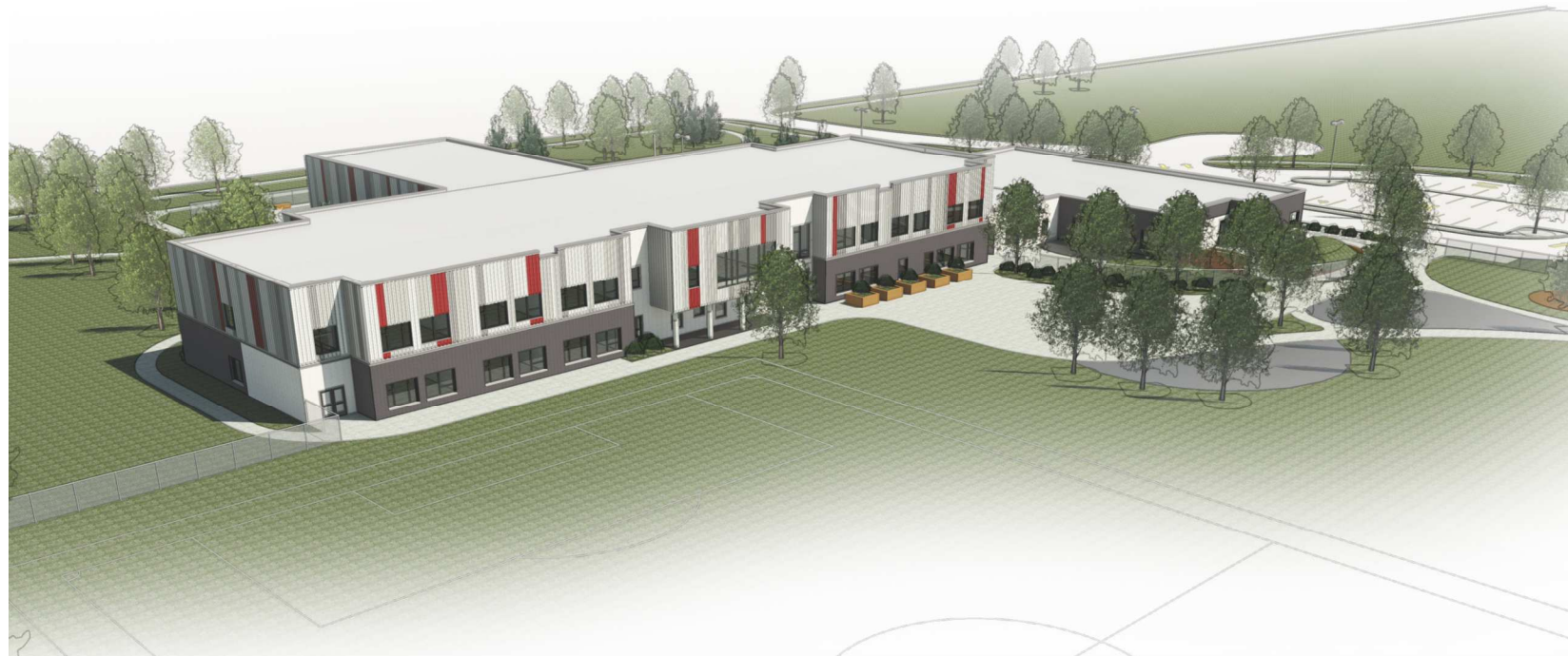
FROM SOUTH WEST