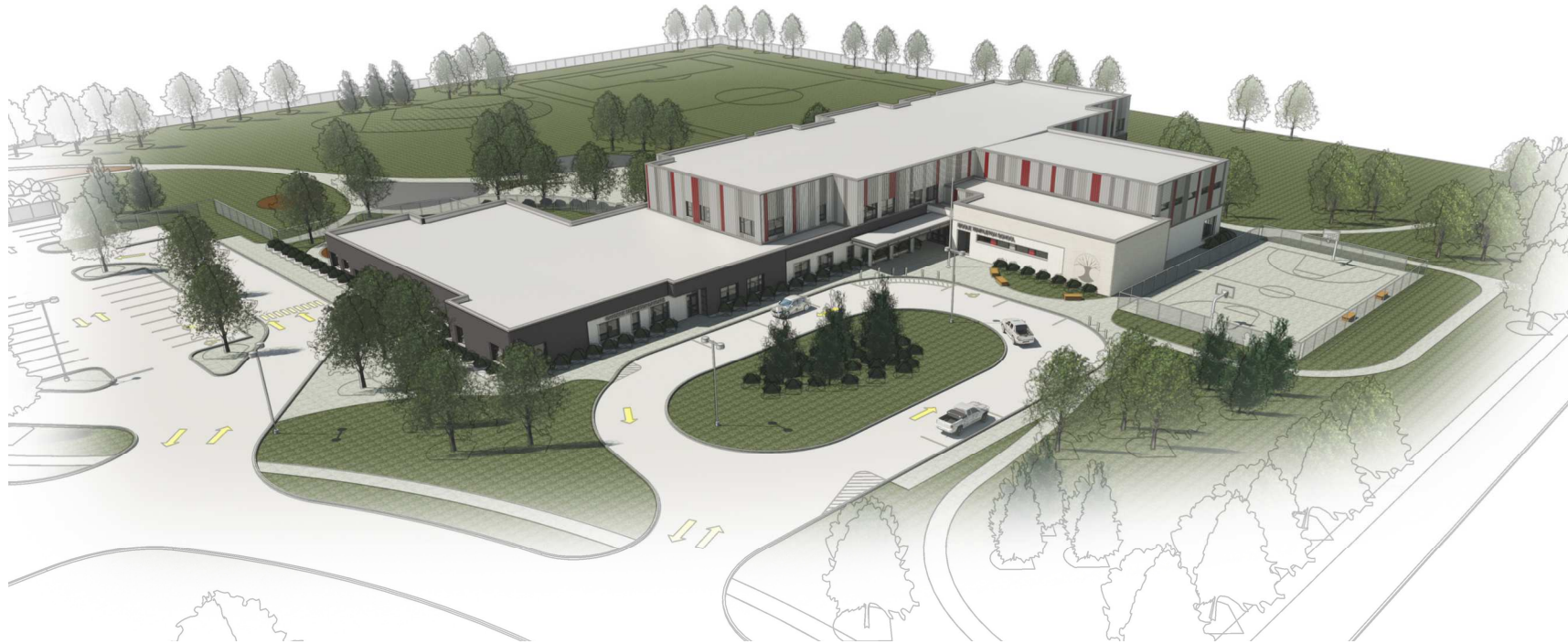
FROM NORTH EAST